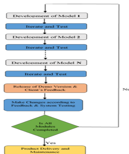
Fig 2. Agile Software Development Life Cycle

Agile software development emphasizes on quick and valuable delivery of the small working units of product and improvising it by adding features or functionality as required in the subsequent iterations or increments. Unlike traditional models it promotes the communication within the teams and among individual involved rather than documentation. It is a result oriented methodology which adapts to the changing requirements, ensures delivery of a high quality product through continuous unit and integration testing, and promotes parallel development and testing of the features.